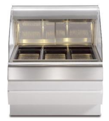
HMR 103 3-well full-serve heated merchandiser

Henny Penny HMR heated merchandisers are designed to provide operators with the ultimate in flexibility and performance for hot food display and service.