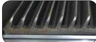
Grooves direct excess oils into tray to prevent oil build up.