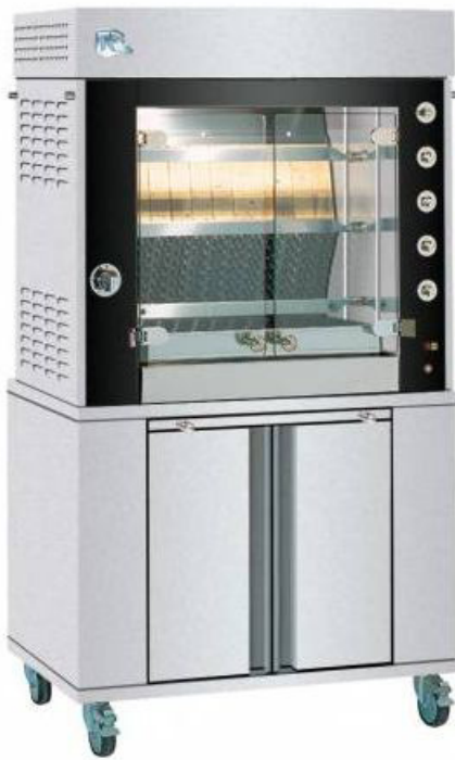
GF975-2 Gas + Roof + Base Cabinet Standard Finish: Stainless steel with Black enamel front panels

Rotisol's GrandFlame Rotisserie Ovens epitomize beauty and functionality, featuring a unique cooking system. Visible flames & elegant finishes provide atmosphere, quality & design provide dependability and spit options and accessories allow for increased diversity.