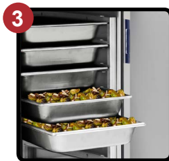
Fixed Rack Assembly