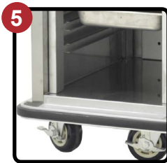
Open Bottom Base