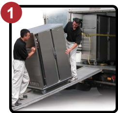
Built For Transport