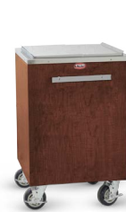
ICE STORAGE CART IC-200 Holds 200 lbs. of ice! Fully insulated. Sliding stainless steel top. Drain, push bar handle, and all swivel 5" casters. Welded stainless steel frame.