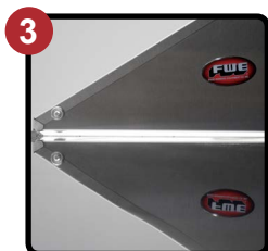
3 Stainless Steel Construction