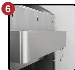
6 Removable Speed Rail