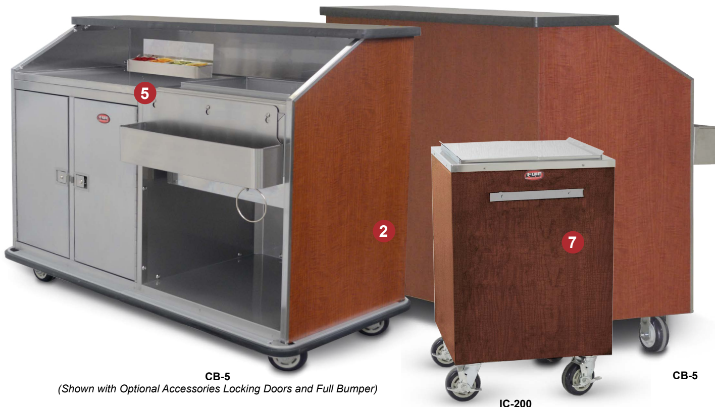
CB-5 (Shown with Optional Accessories Locking Doors and Full Bumper)