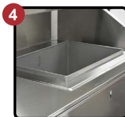
4 Ice Sink