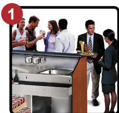
1 Perfect For Event Hosting