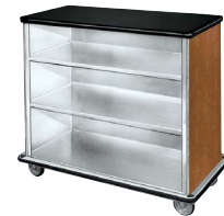
BACK BAR PSC-4 Enclosed on 3-sides! Stores glasses and bar accessories. Convenient work/serve black top. Stainless steel interior shelves with 9.5", 11.5", and 14" clearance. Welded stainless steel frame. 5" casters. Shown with full bumper optional accessory