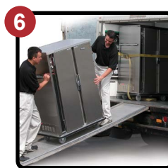
Built For Transport