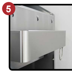
Removable Speed Rail