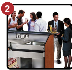
Perfect For Event Hosting