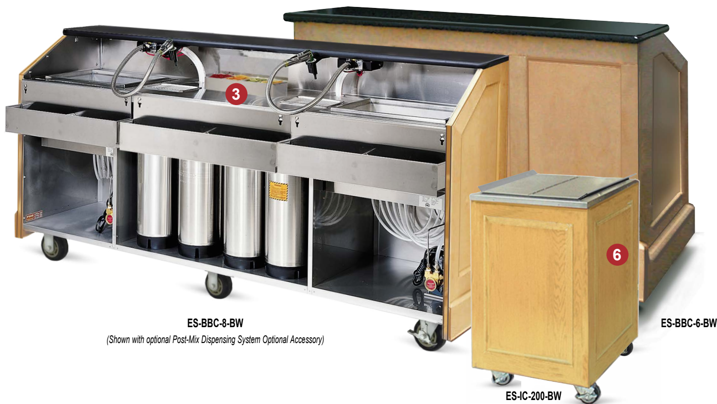
ES-BBC-8-BW (Shown with optional Post-Mix Dispensing System Optional Accessory)