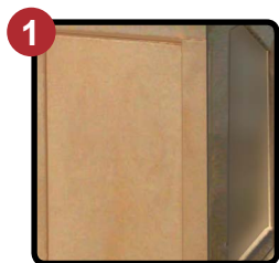
Solid Birch Wood